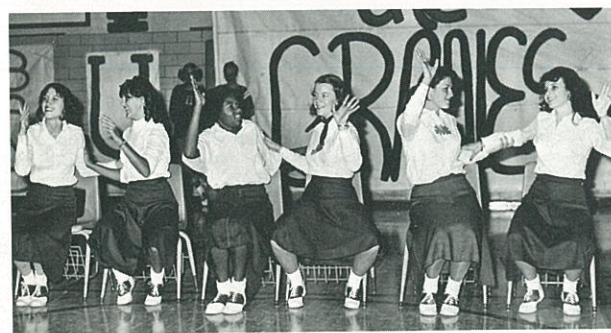
Cheerleaders perform skit during 1950's Day.