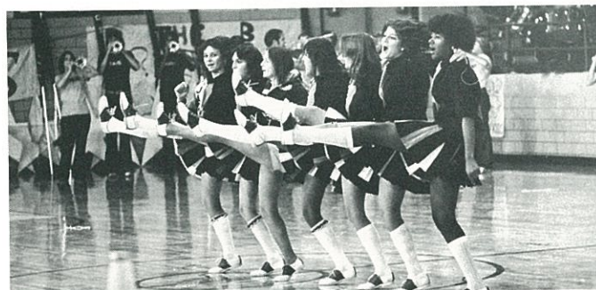
KHS Chorus Line?