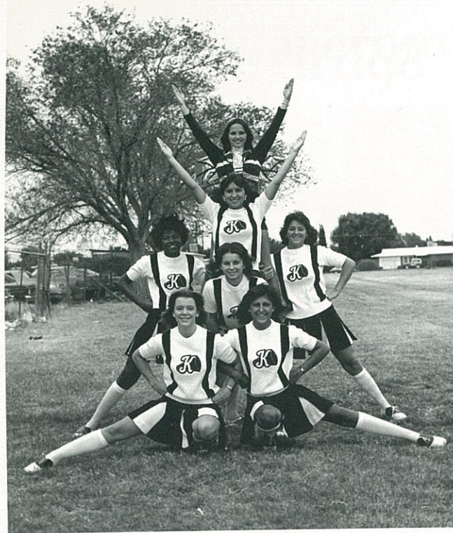
Members of the varsity cheerleading squad are SHOWN ABOVE practicing a formation to be used in backing the Jackets throughout the year.